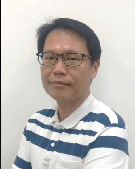
Principal Engineer, Egis Technology Inc.