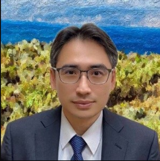
Deputy General Director of ICL, ITRI